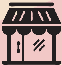
Single Store Retailer